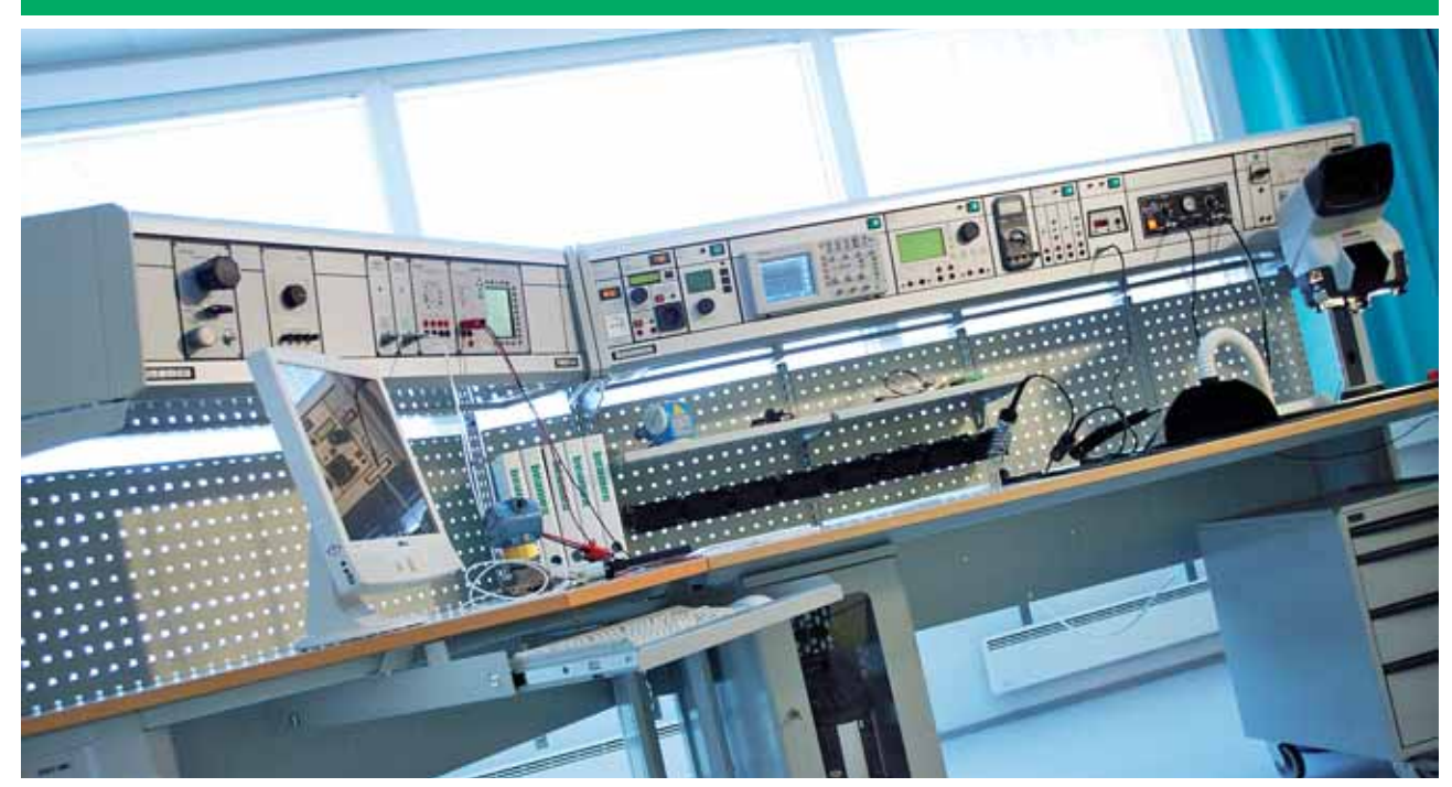
The POC6 can be panel mounted into Beamex® MCS100 Workstation, Mobile Trolley or Desktop Cabinet.

Together with the Beamex® MC5 or MC5P calibrators as well as the Beamex® CMX Calibration Software, the POC6 offers an integrated, automated calibration system for performing, documenting and managing calibrations easily and efficiently.